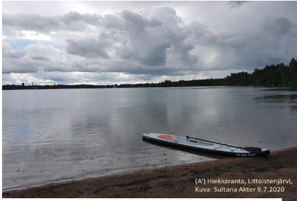
(A) Hiekkaranta, Littoistenjärvi, Kuva: Sultana Akter 9.7.2020