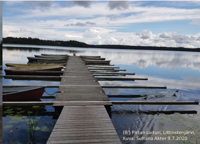
(B) Pirtan Laituri, Littoistenjärvi, Kuva: Sultana Akter 9.7.2020