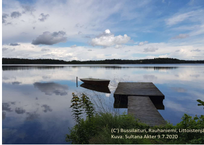
(C) Bussilaituri, Rauhaniemi, Littoistenjärvi, Kuva: Sultana Akter 9.7.2020