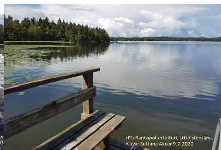
(F) Rantapolun laiturii, Littoistenjärvi, Kuva: Sultana Akter 9.7.2020