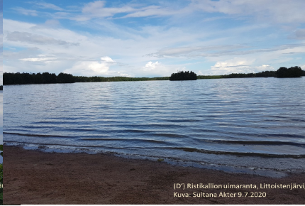
(D) Ristikallion uimaranta, Littoistenjärvi, Kuva: Sultana Akter 9.7.2020