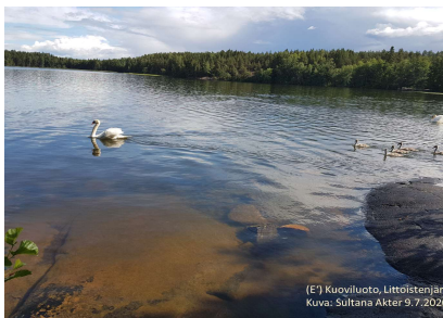
(E) Kuoviluoto, Littoistenjärvi 9.7.2020